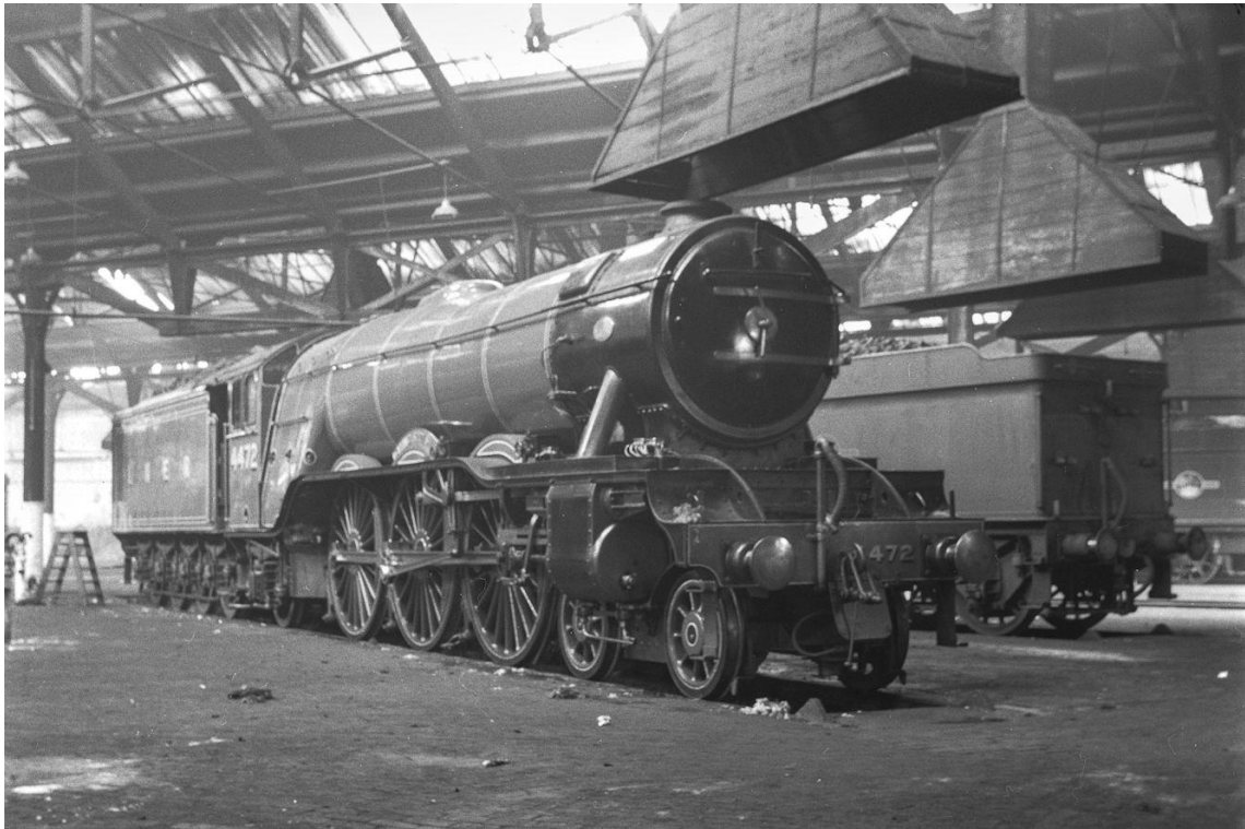
October 18 th , 1963, No. 4472 FLYING SCOTSMAN within Old Oak Common Roundhouse.