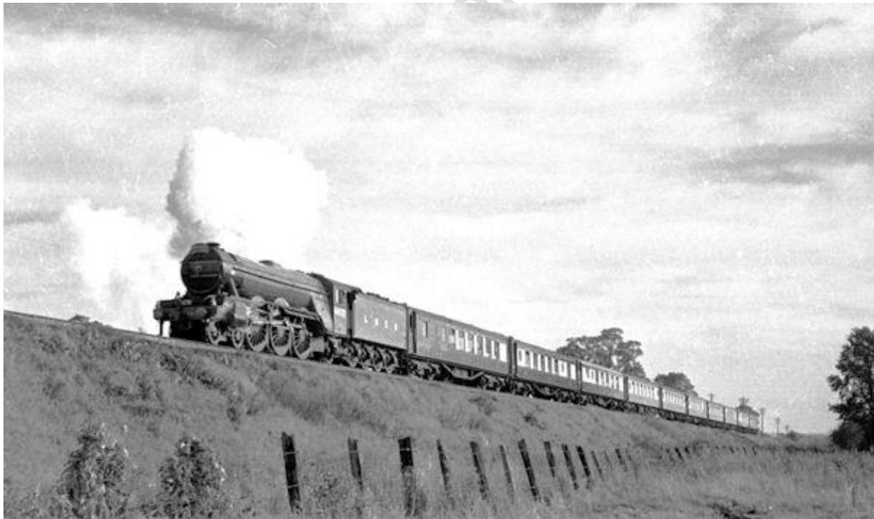
October 19 th, 1963, No. 4472 FLYING SCOTSMAN On the Devizes Branch.

Pullman Car Services-Archive - Special Edition N o 30 - Remembering the "WESTERN BELLE" Saturday October 19th, 1963.