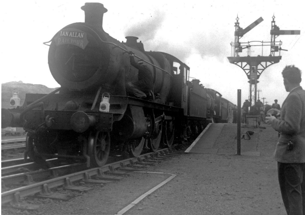
© Keith Jackson - IM 003-25 Ian McDonald Collection.

Ilfracombe Station - GWR Class 4300 2-6-0 No. 7317 & GWR Class 9300 2-6-0 No. 7322.