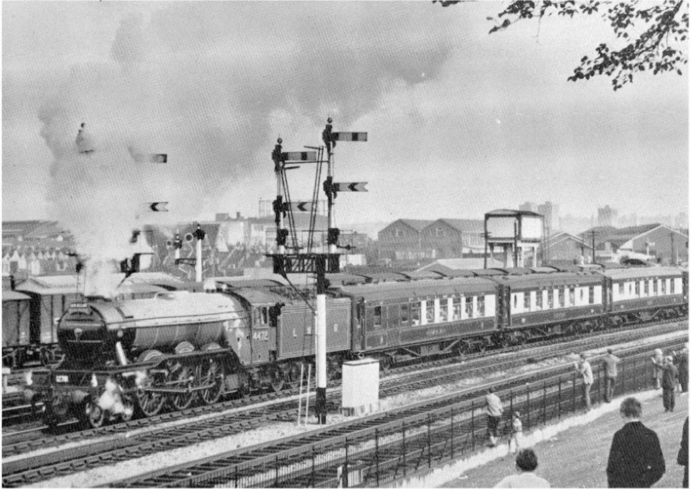
© E. Thomas - Railway World November 1963.