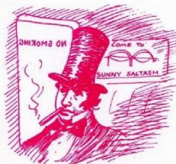
Mr. Brunel travelling on an early G. W. R. train between Exeter and Salisbury.

The directors and staff of Ian Allan Ltd. hope that they have satisfied you in some way with their efforts over the past 21 years, and that this sentimental journey to the west will be a memorable one.