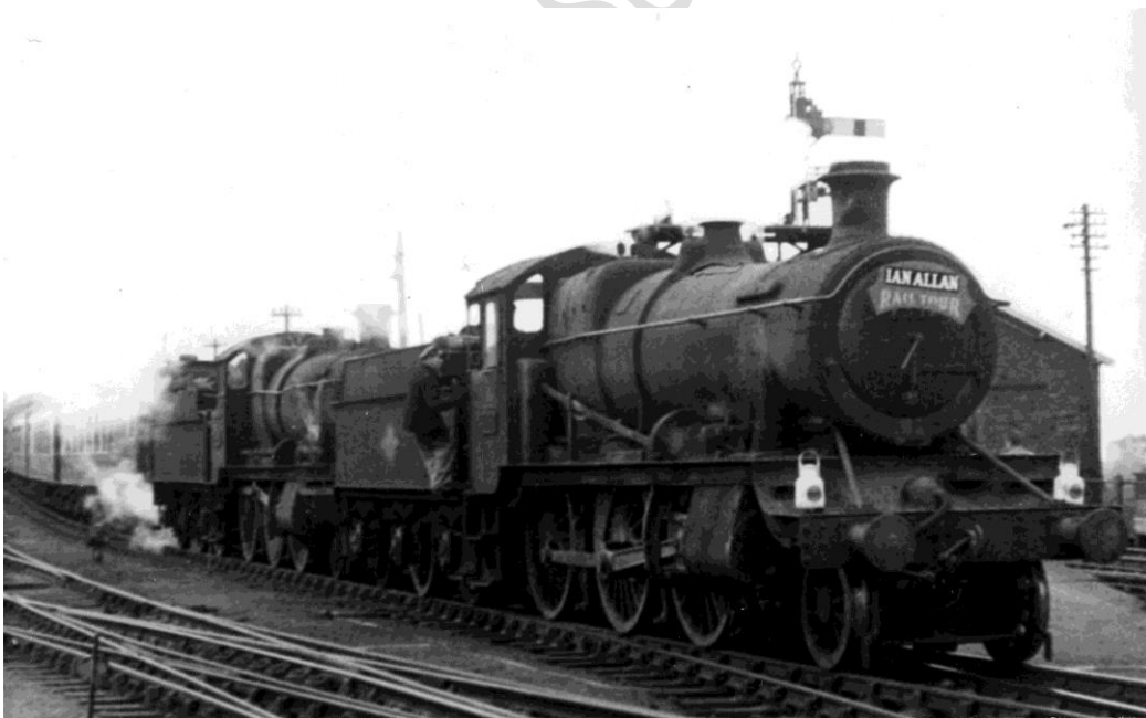
© Keith Jackson - IM 004-25 Ian McDonald Collection.

Ilfracombe Station - GWR Class 4300 2-6-0 No. 7317 & GWR Class 9300 2-6-0 No. 7322.