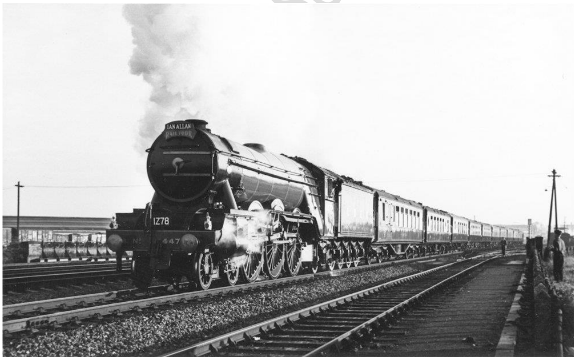
October 19 th , 1963, No. 4472 FLYING SCOTSMAN Passing Old Oak Common.

Pullman Car Services-Archive - Special Edition N o . 30 - Remembering the "WESTERN BELLE" Saturday October 19th, 1963.