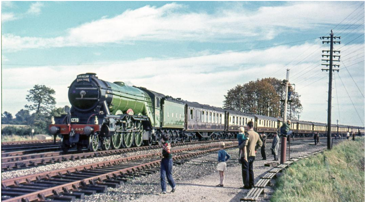
© Michael Whitehouse Collection - IM005-25 Ian McDonald Collection October 19 th , 1963, No. 4472 FLYING SCOTSMAN Passing Holt Junction.